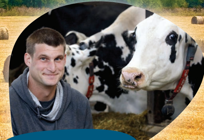
CULL CATTLE and dairy calf