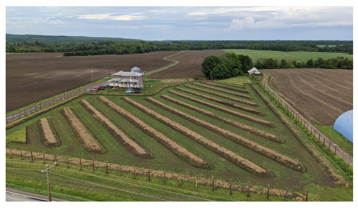
Picture 11: The food forest is planted; seeds are sown between the embankments; the vegetation cover spreads out.